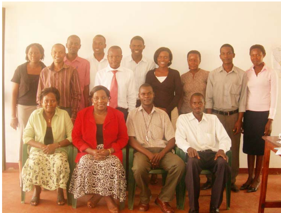
The Super Savers Team pose for a Photograph with the PEDN Secretariat Team led by the Executive Director [Second Left, Seated] at the PEDN Jinja Field Office-Jinja District after a staff orientation.